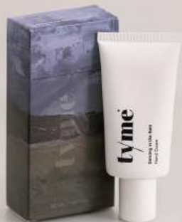
Dancing in the Rain (50 mL)