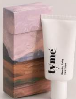
Blooming Spring (50 mL)