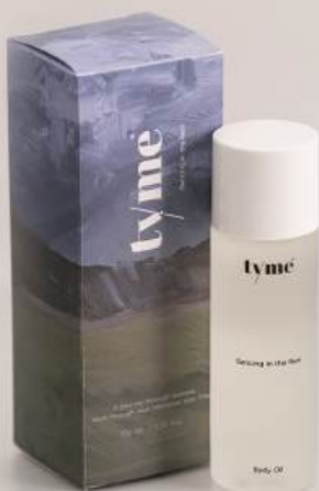
Dancing in the Rain (100 mL / 60 mL)