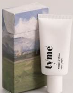
Whisper of Winter (50 mL)