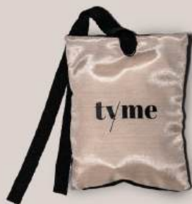
Dancing in the Rain Whisper of Winter Blooming Spring Summer Sunday