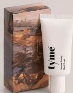
Summer Sunday (50 mL)