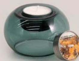
Dancing in the Rain Whisper of Winter Blooming Spring Summer Sunday