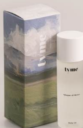
Whisper of Winter (100 mL / 60mL)